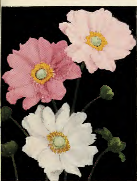
Our Japanese Anemones are unsurpassed